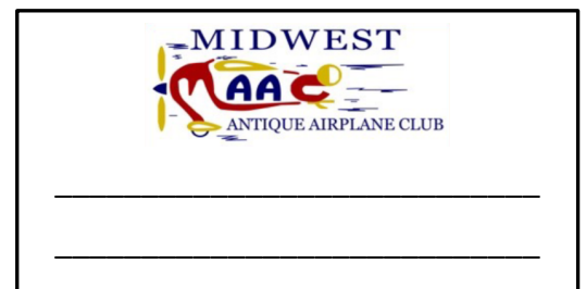
Spouse's Badge (if applicable)